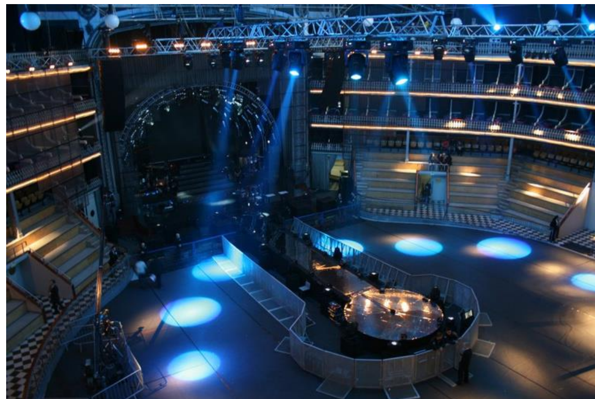
Fado Concert, Coliseu dos Recreios